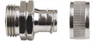
Type A: MBA