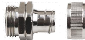
Type A: ZAM