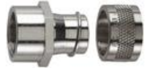
Type A: ZAF