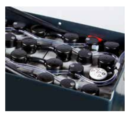
Complete system for water filling of lead acid traction batteries automatically without manual intervention.