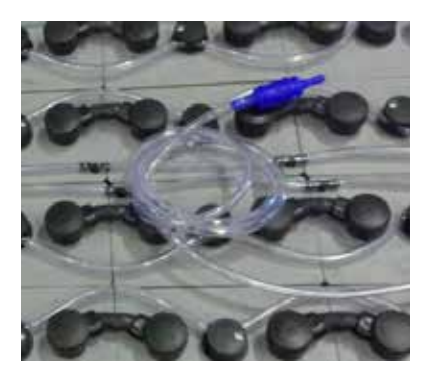
The electrolyte circulation system ensures a permanent electrolyte movement inside the cell. The air pumped into the base of the cell maintains an electrolyte circulation offering lower water consumption, lower battery temperature and long life.