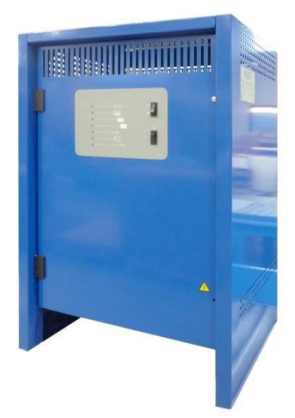
Battery chargers range available in several voltage versions to meet the charging requirements of most battery sizes.